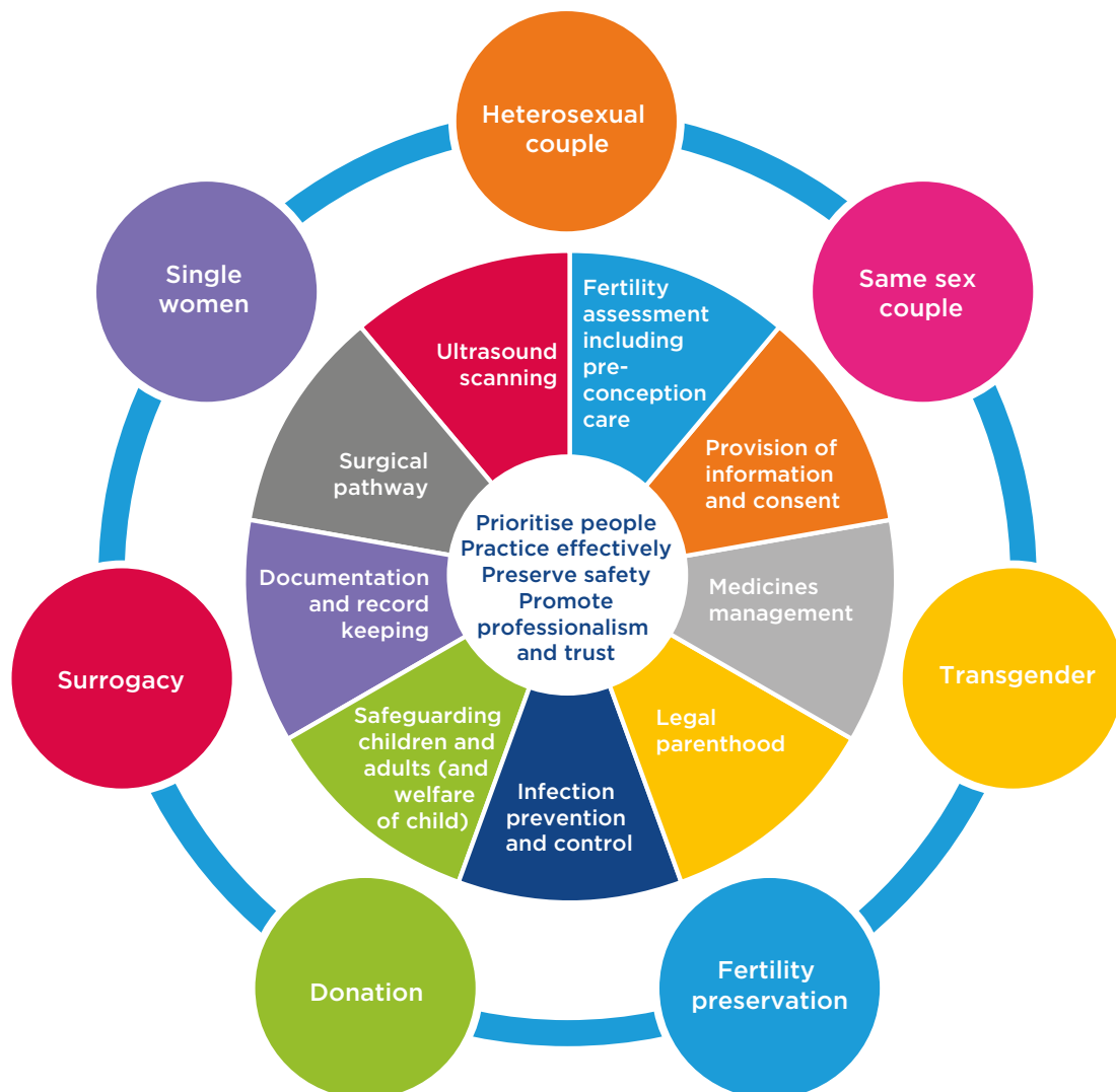
Figure 2: RCN competency framework for career progression in fertility nursing model

Note: adapted from the National Curriculum Competency Framework for Emergency Nursing (RCN, 2017)