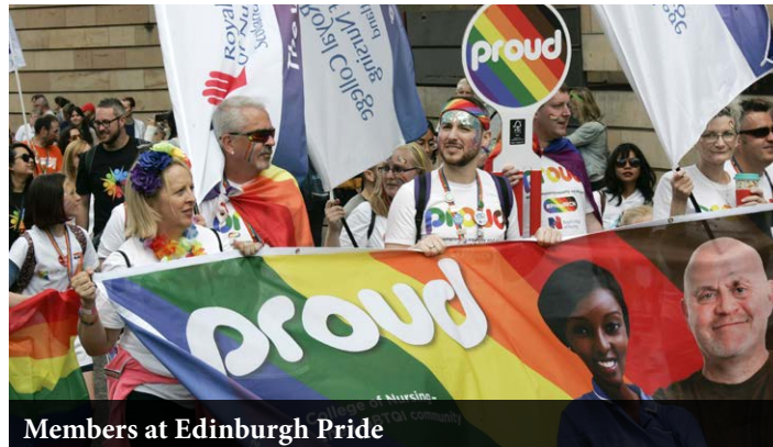
Members at Edinburgh Pride