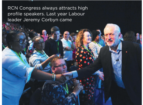
RCN Congress always attracts high profile speakers. Last year Labour leader Jeremy Corbyn came

With the launch of the new RCN Magazines website you can now find the features from this and previous issues of Health+Care online. The site works on mobiles so you can read articles, watch videos and look at picture galleries on the move. Visit www.rcn.org/magazines