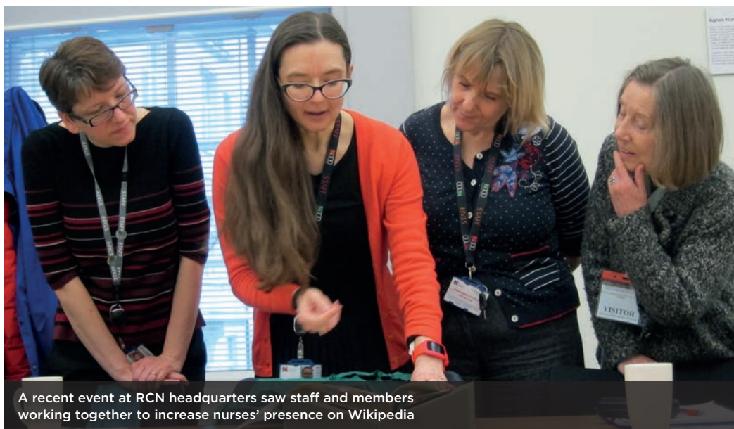
A recent event at RCN headquarters saw staff and members working together to increase nurses' presence on Wikipedia