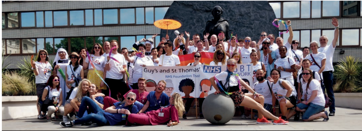
RCN members join Guy's and St Thomas' NHS Foundation Trust LGBT Forum