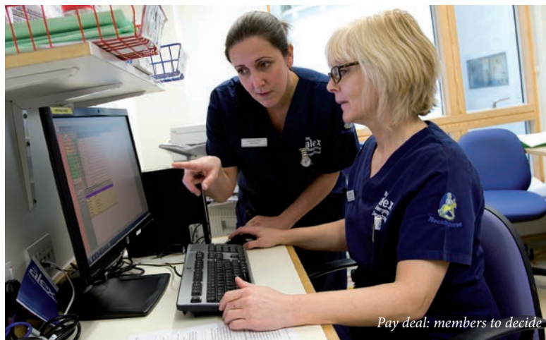
Pay deal: members to decide

Meanwhile, the RCN What if...? campaign to defend pay and conditions will continue. Members in selected NHS workplaces in England and Northern Ireland are being encouraged and assisted to seek time off in lieu or payment for excess hours worked.